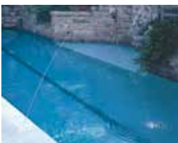
Single 3/16" Stream