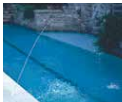
Single 1/4" Stream