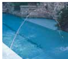
Single 5/16" Stream