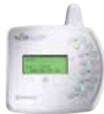
EasyTouch System Wireless Controller