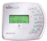
EasyTouch System Indoor Control Panel (for 4 or 8 function control)

EasyTouch® systems are available for a separate spa, a separate pool, or a pool/spa combination with shared equipment. You select from systems that control four or eight accessory functions. Four-function systems are typically used to control pool and/or spa operation plus pool or spa lights and heaters. Eight-function systems allow separate scheduling for additional features, such as landscape lighting, waterfalls, fountains, additional heaters and more. Take the work and worry out of scheduling and operating pool and spa heating, filtration and cleaning cycles. For even greater convenience, you can add any of these optional controllers: